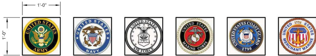
MILITARY BRANCH PLAQUES