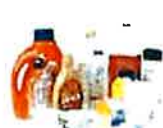
Plastic Bottles and Containers #1-7