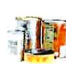
Tin or Steel Cans