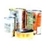
Tin or Steel Cans